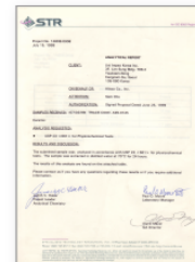
FDA STR certification

Patented ingredient certified by FDA Convenient use by adhesive jelly type Excellent performance against price